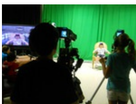
The Video Campers operate studio