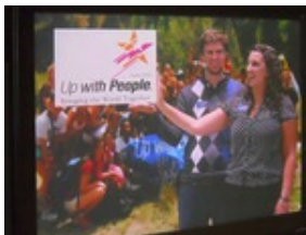
Up With People visited the ActonTV studio and produced a Public Service Announcement about upcoming shows