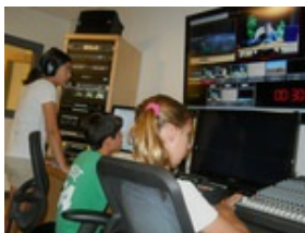
Our Summer Video Camp for Kids was a great success