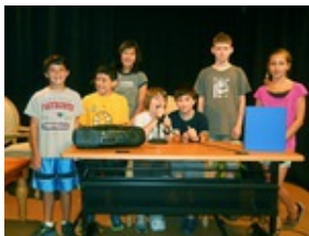
Summer Video Camp for Kids participants